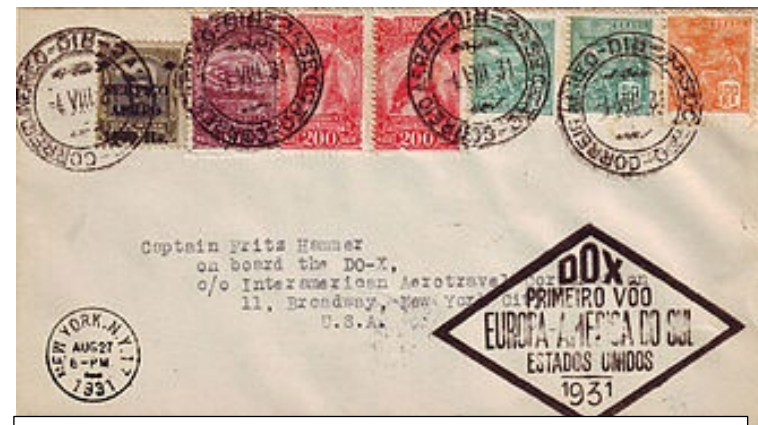
Cover carried from Rio de Janeiro to New York on the Do-X, August 5–27, 1931

The Do X remained an exhibit until it was destroyed in an RAF air raid during World War II on the night of 23–24 November 1943. Fragments of the torn-off tail section are on display at the Dornier Museum in Friedrichshafen. While never a commercial success, the Dornier Do X was the largest heavier-than-air aircraft of its time, and a pioneer in demonstrating the potential of an international passenger air service. A successor, the Do-20, was envisioned by Dornier, but never advanced beyond the design study stage.